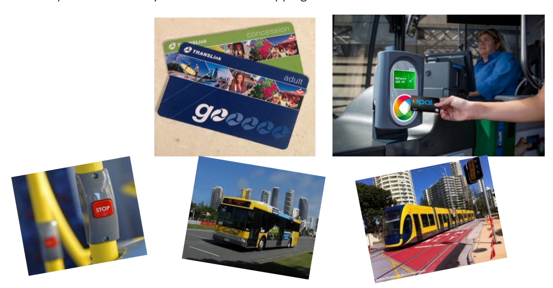
36.1 Transport – Getting Around on the Gold Coast....It's Really Easy

Please make sure when you get your student Go Card that you always have funds (money $) on your card and that you tap on and off when on the buses, trams or Brisbane ferry services. Please see below the tap on device that you will see when stepping on and off the buses and trams and ferries.